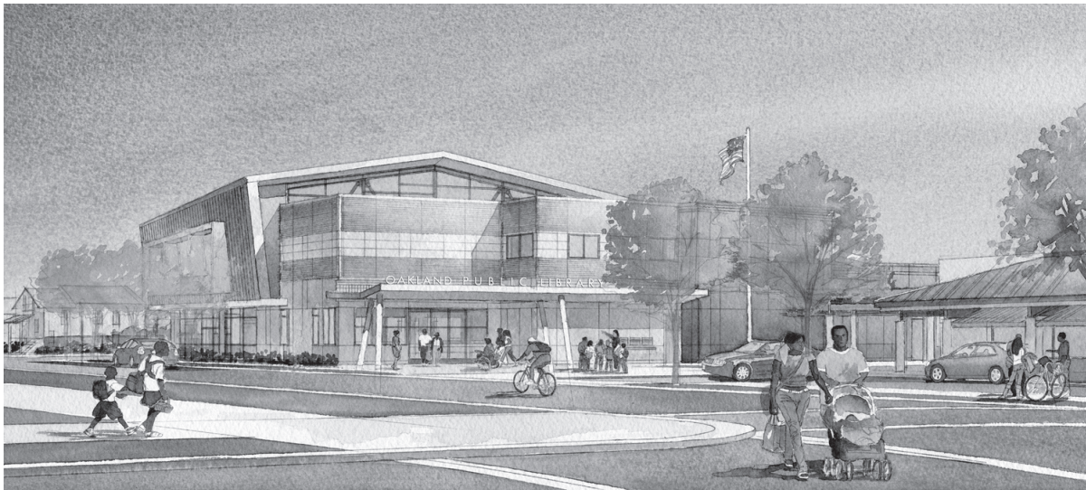
EAST OAKLAND COMMUNITY LIBRARY AT 81ST AVENUE [ GROUP 4 ARCHITECTURE, RESEARCH AND PLANNING ]

A new public library, serving also as a school library for two public elementary schools, will bring important new informational and community-building resources to East Oakland.